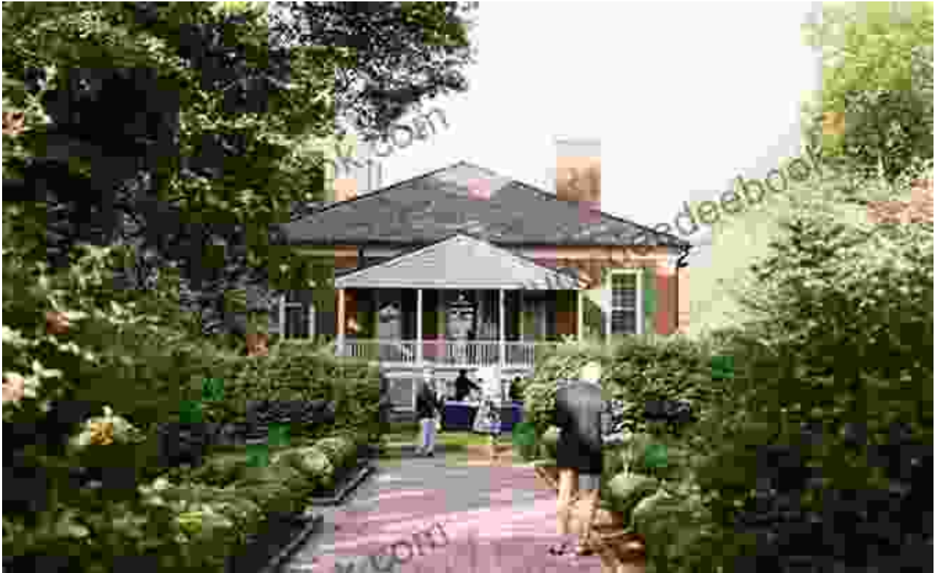
A group of people touring a historic plantation in Kentucky