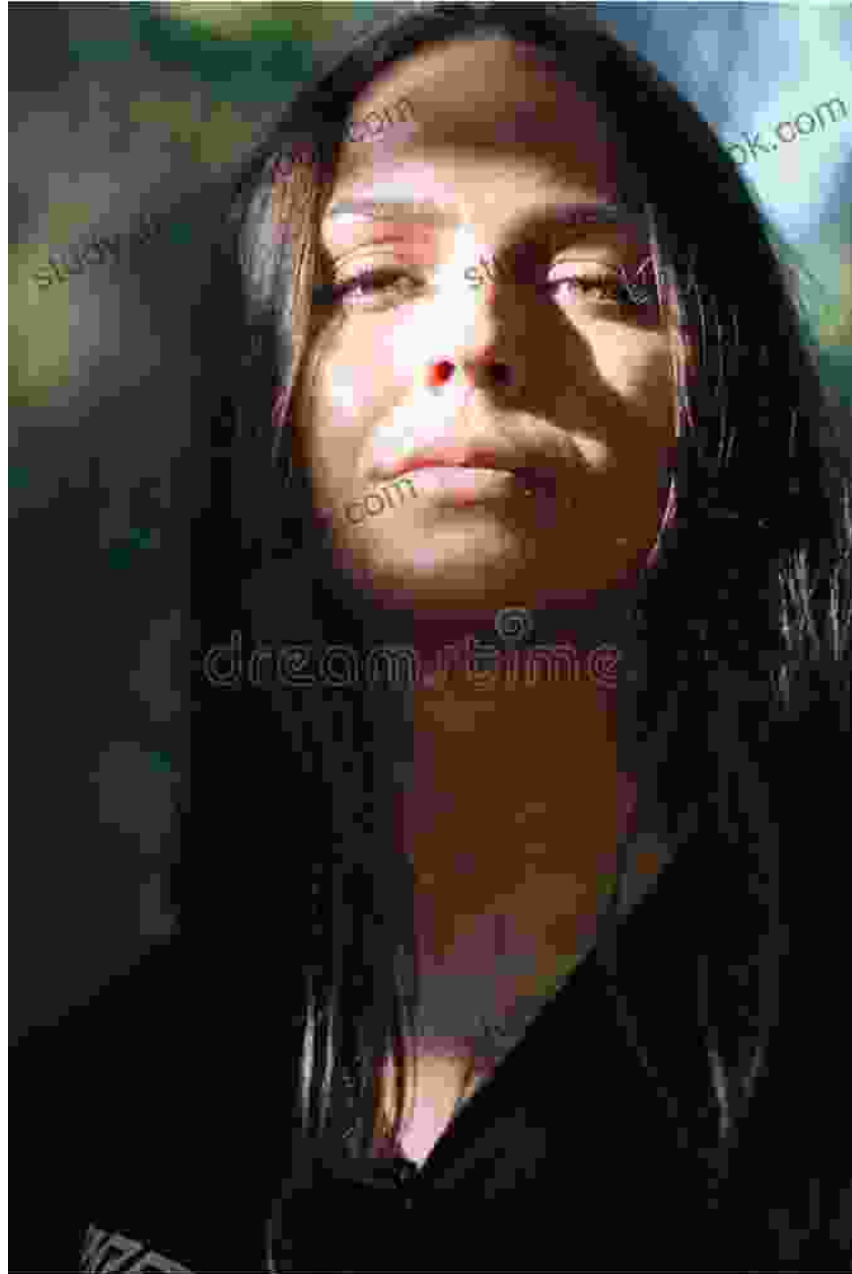
Figure 2: "Self-Portrait" by Lori Haskins Houran

Many of Houran's paintings explore the elusive nature of identity. Her portraits capture individuals in moments of quiet introspection, their faces often obscured or fragmented, suggesting the fluidity of self-perception. The viewer is left questioning the identity of the subjects and their place in the larger narrative of the painting.