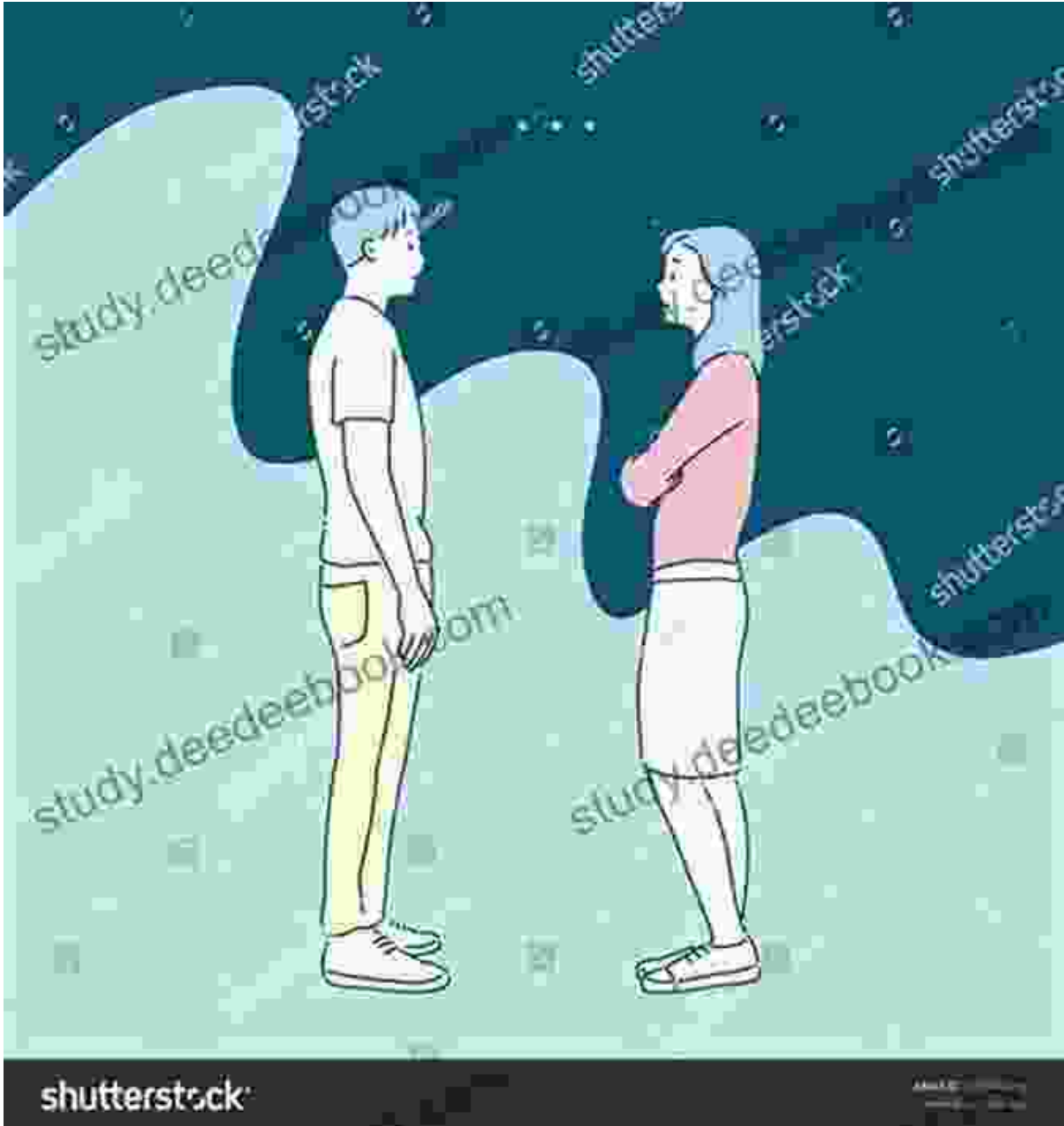
Figure 4: "The Search for Meaning" by Lori Haskins Houran

Underlying Houran's paintings is a profound search for meaning in a complex and often chaotic world. Her work explores the existential questions that haunt us all, such as the meaning of life, the nature of reality, and the human condition.