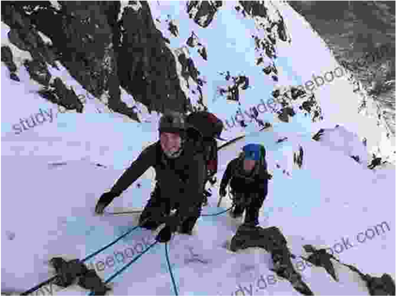
Image Caption: Thrill-seekers scaling an icy slope on Ben Nevis during a winter climb guided by Cicerone Guides