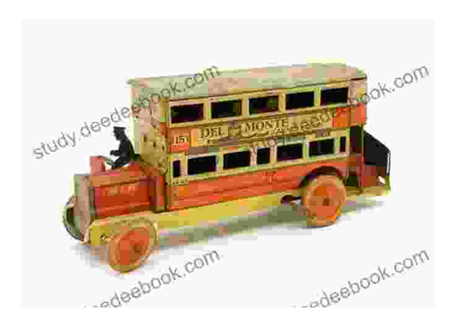
Types of Buses and Coaches

During World War II, buses played a vital role in transporting troops and supplies. In the post-war era, the rapid expansion of Australian cities and towns led to a surge in demand for bus services, leading to the establishment of numerous bus companies.